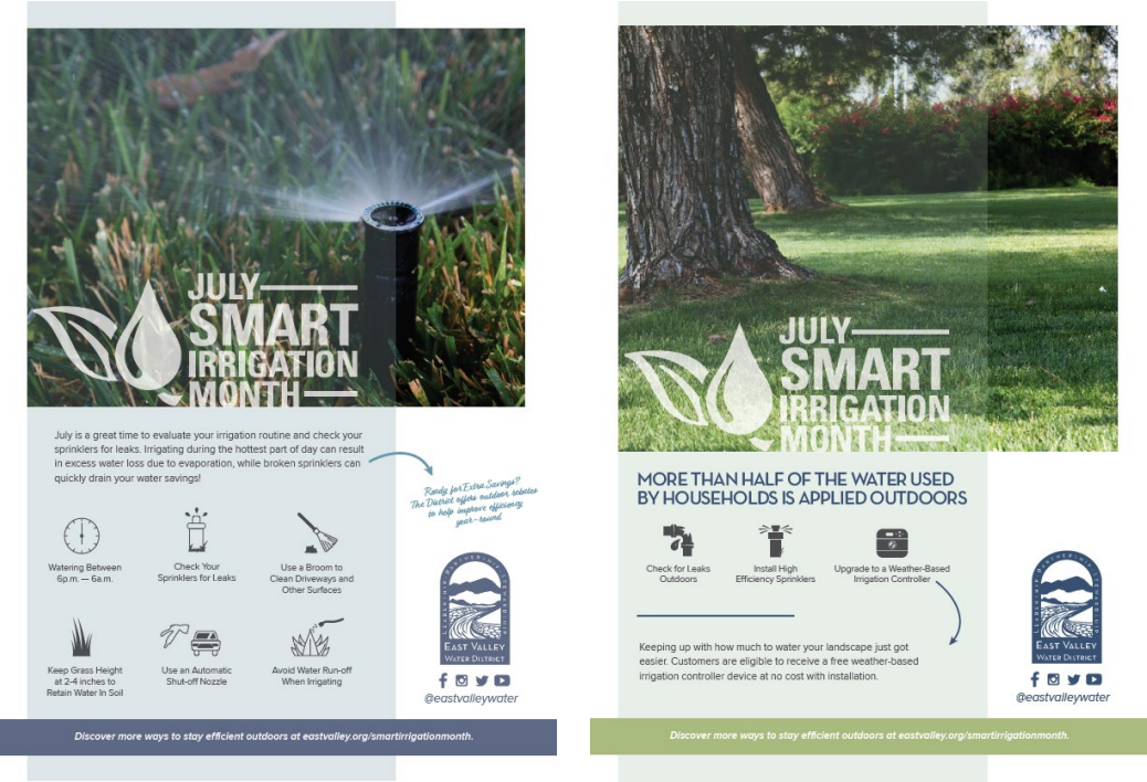
Highland Community News Ads